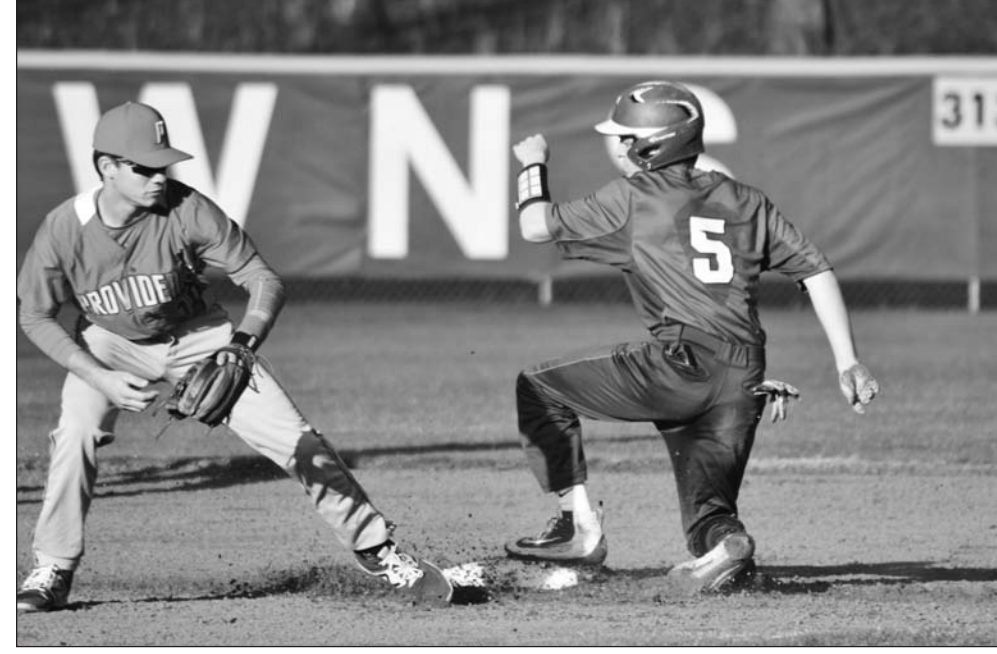
Towns County baseball was victorious 10-0 over Providence.